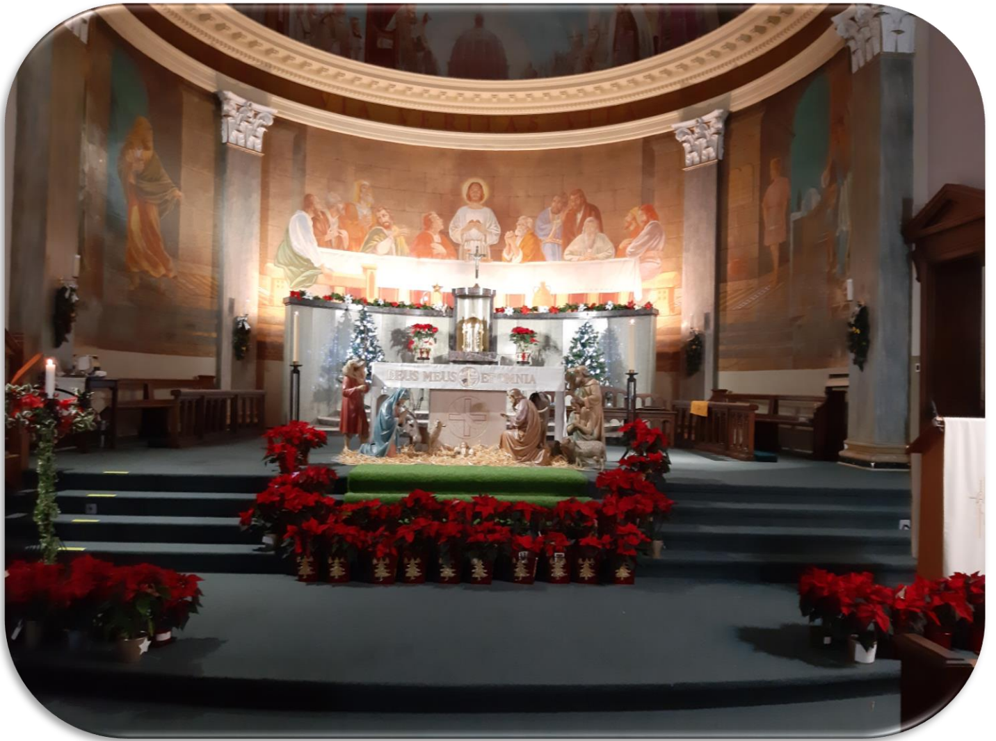
The Nativity scene in St. Anthony of Padua Mossley Hill Christmas 2020